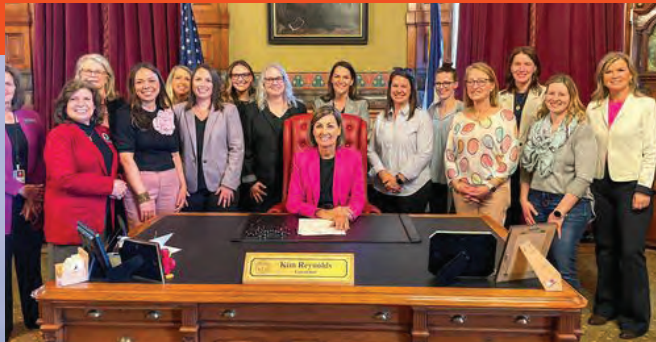
Iowa Governor Kim Reynolds with Interior Design advocates for the passing of practice rights legislation